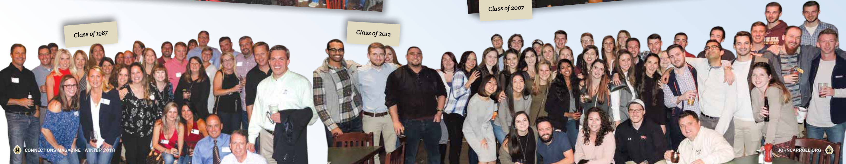
Class of 2012