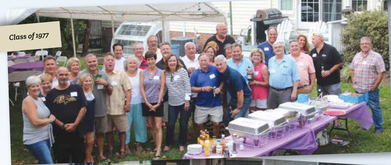
Class of 1977