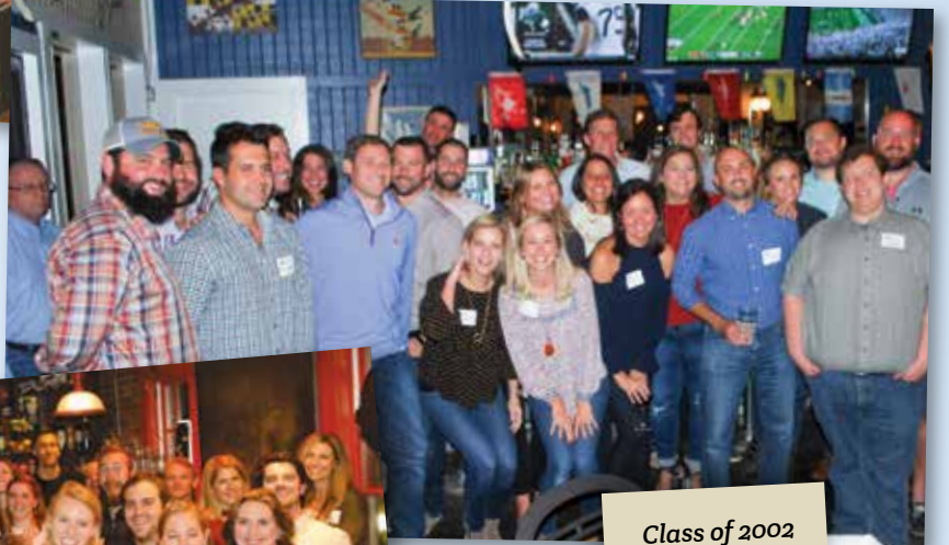
Class of 2002