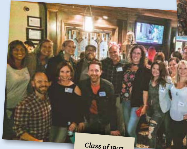
Class of 1997