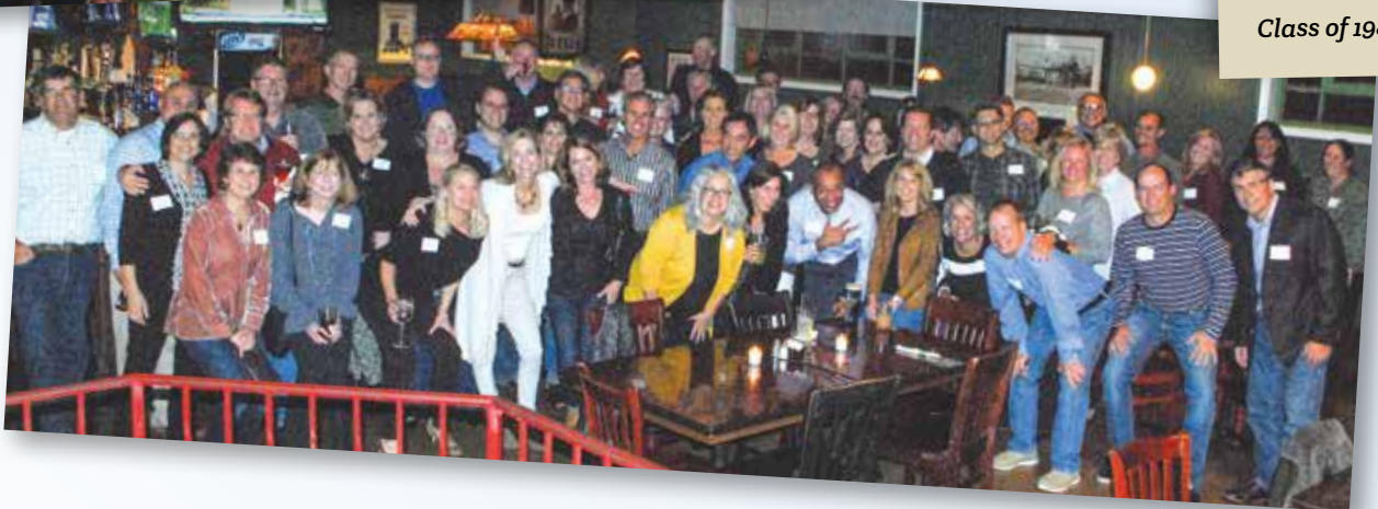
Class of 1982