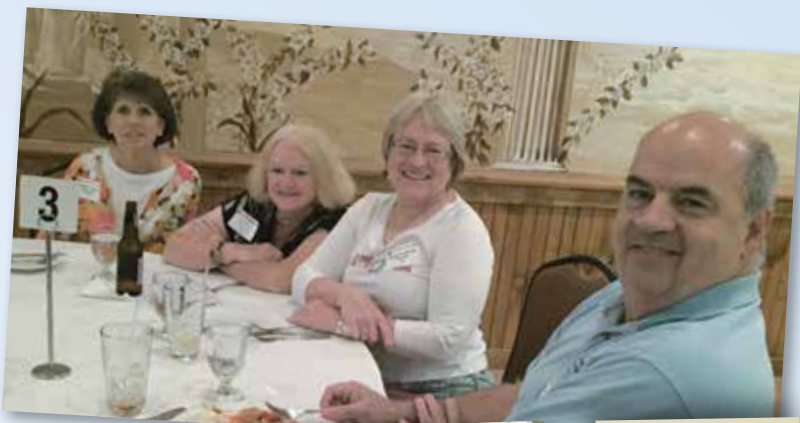
Class of 1972