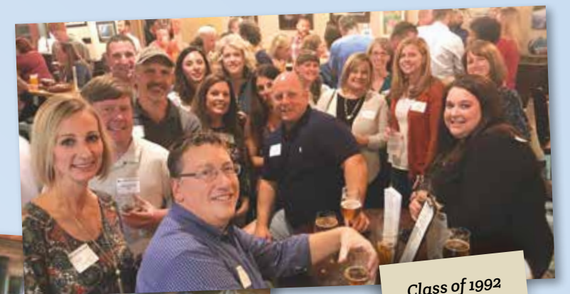
Class of 1992