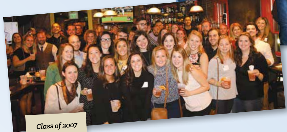
Class of 2007