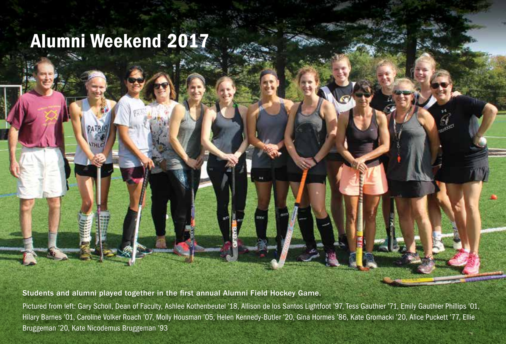
Students and alumni played together in the first annual Alumni Field Hockey Game.